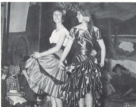
Two Latin Ladies entertain the wagon train.

The second half of the evening was informal, and the audience settled back