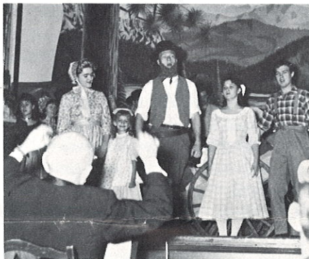
The "Hand Cart" Song