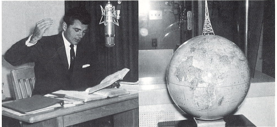
Mr. Garner Ted Armstrong thunders God's message . . . around the world!

Before the broadcast reaches KBLA, it goes through several fascinating electronic processes. First of all, from the Telefunken microphone, it passes into the Mixing Console and on into the Limitter . The Limitter compresses the high volumes which would cause trouble on the air and on the recording