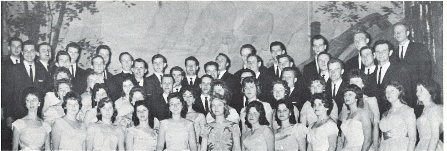
Members of the Ambassador College Chorale of 1962 during their annual Spring Concert.