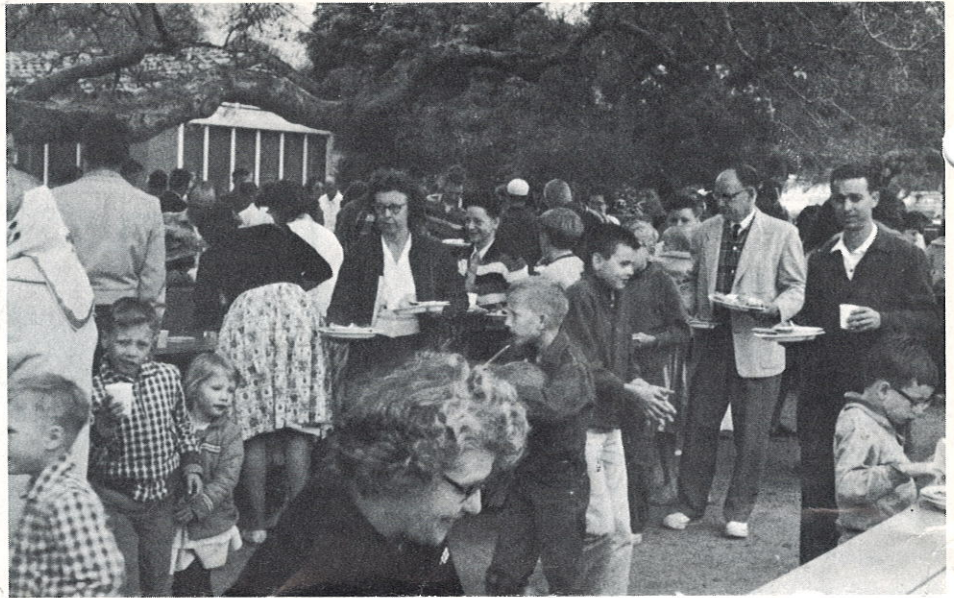
Hot chili adds to recreation and fellowship at Spokesman Picnic.