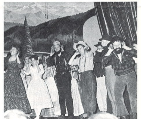
"Skip to My Lou"

piano whose ability and talent always does so much for the Chorale presentations.