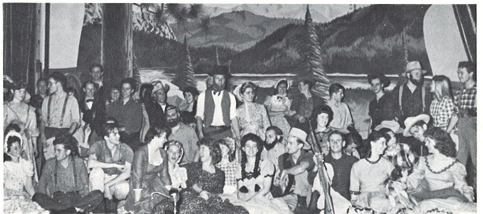
Candid photograph taken at conclusion of "Westward Ho!" concert.

This concert set a mark that will be hard to surpass for a long time to come.